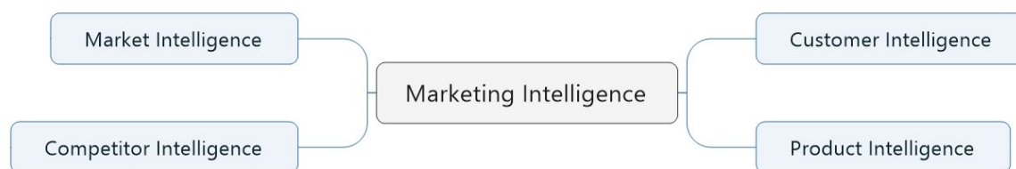
Figure 1 – Customer Intelligence Structure

customers can be used for various analytic processes to create customer intelligence to better profile and classify customers, predict customer behavior, conduct target marketing, cross and up sell into existing customer base, noticed Joseph O. Chan. [9]